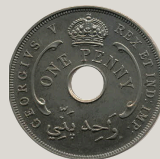
British West Africa One Penny 1935