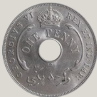
British West Africa One Penny 1940