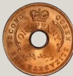
Federation of Nigeria One Penny