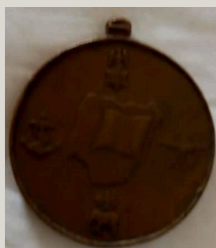
Nigeria National Service medal