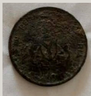
ONE KOBO 1973-1974