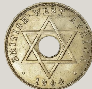
British West Africa One Penny 1944